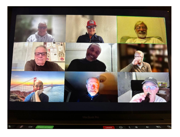
Location: Everywhere in our Randonneurs USA community Details: All incoming and outgoing Board of Directors on the December 8th, 2024 leadership meeting.

Your Board has chosen the 2025 officers in our January meeting: