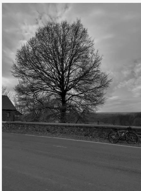
Location: Warren Township, New Jersey Details: Roadside stop in the leafless season.

The Permanent Audit Committee would like a few volunteers, no skill set required and time requirement is less than an hour a month. Interested in hearing more details? Reach out here .