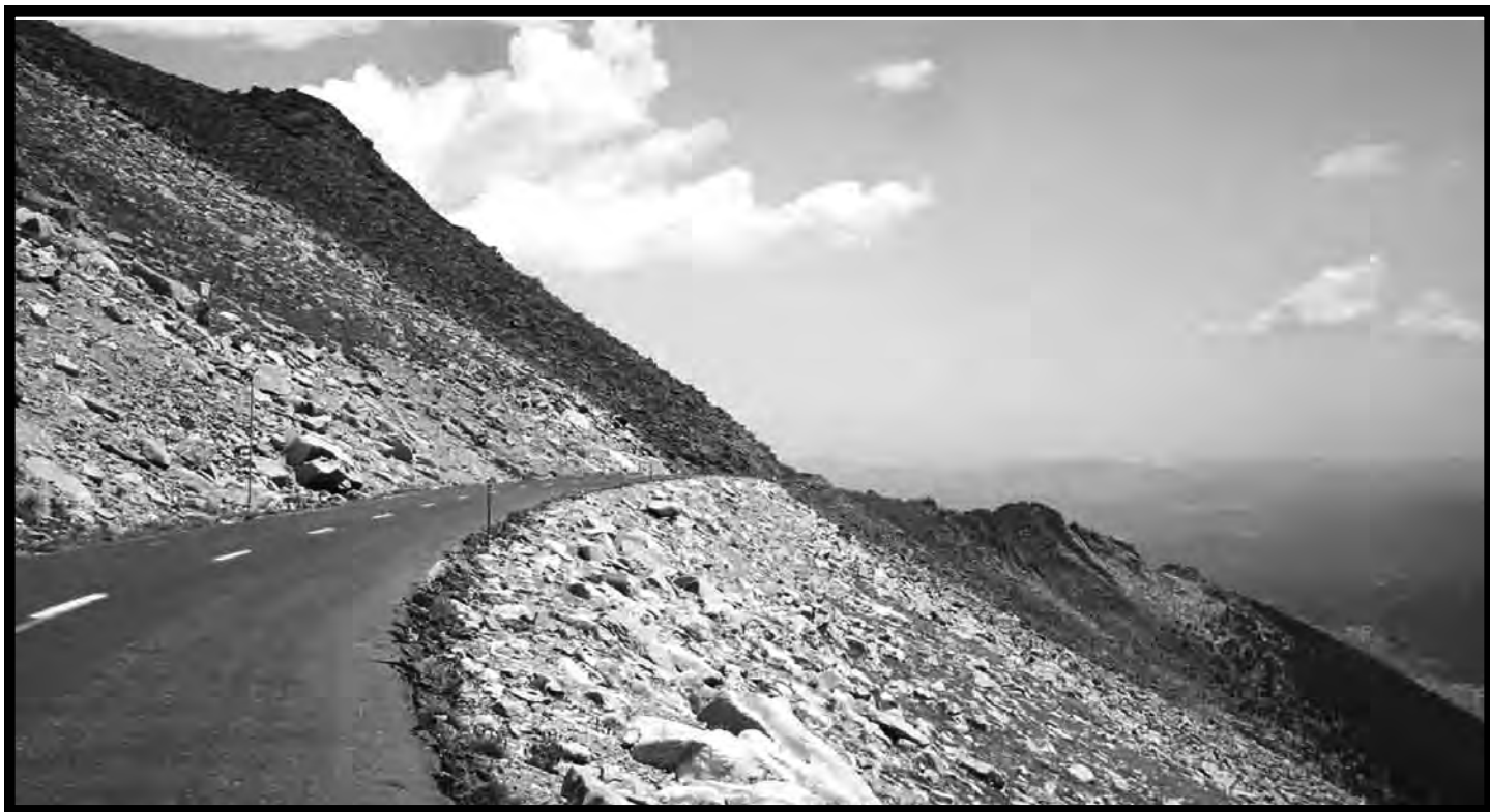
Into thin air. Above the timberline, descending the 14,264-foot Mt. Evans in Colorado. At that altitude, the view literally takes your breath away.