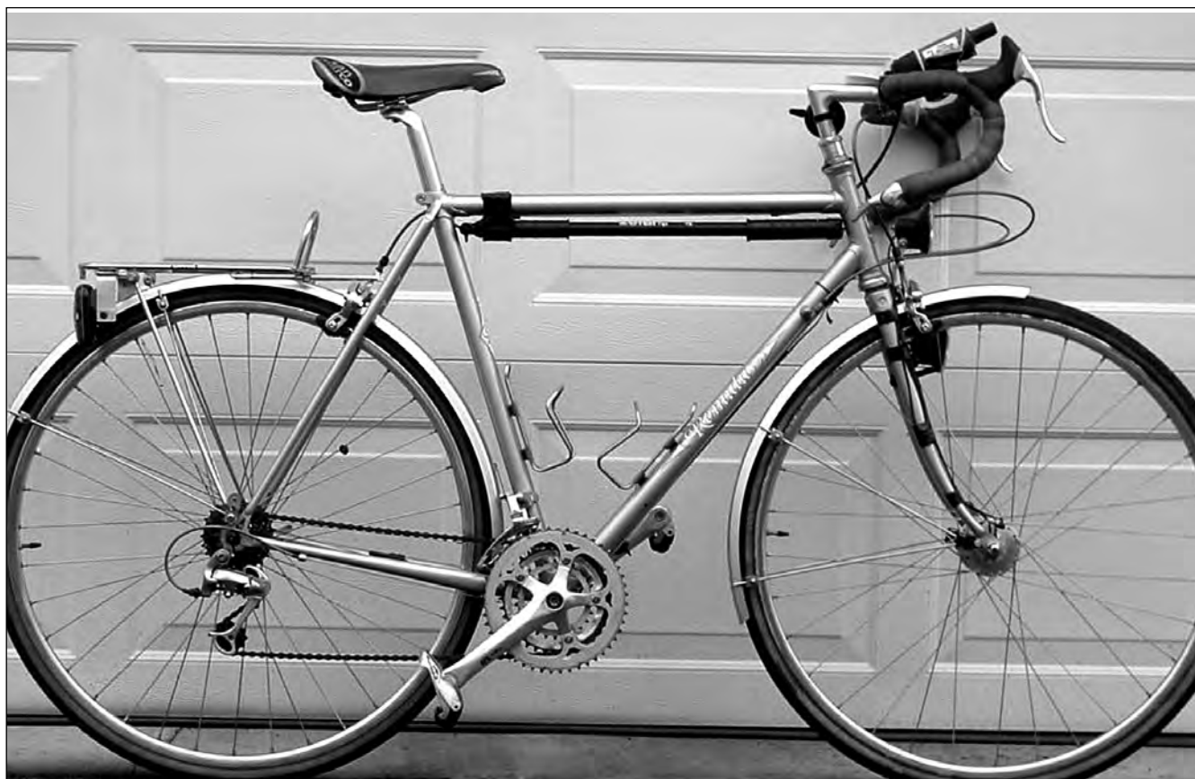
Note fenders, deep bottom bracket drop, tail lights, saddle/handlebar relationship, rack placement.