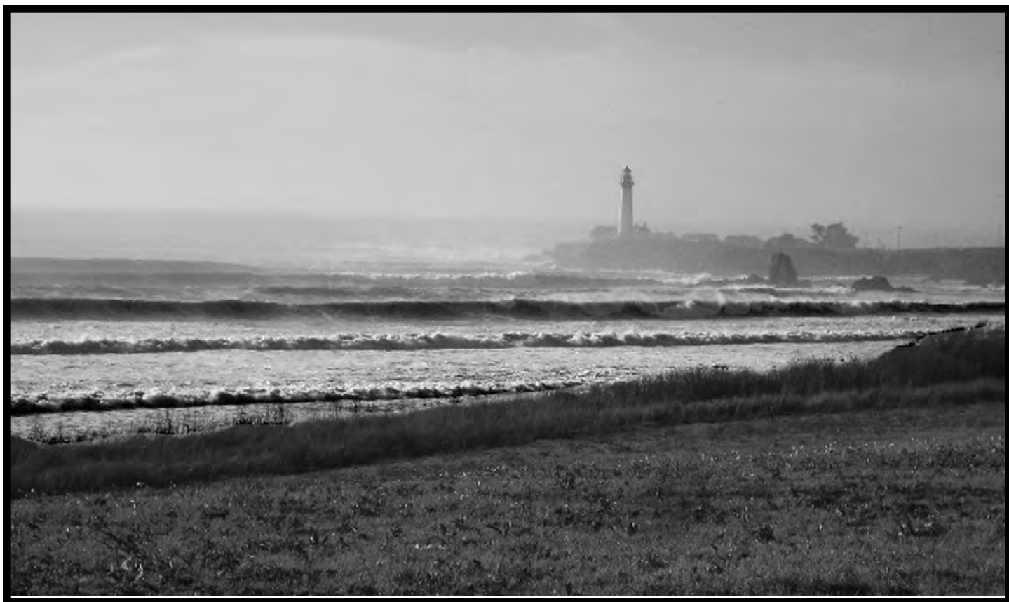
Surf's up. Rides sponsored by the Santa Cruz club often go past the Pigeon Point lighthouse.