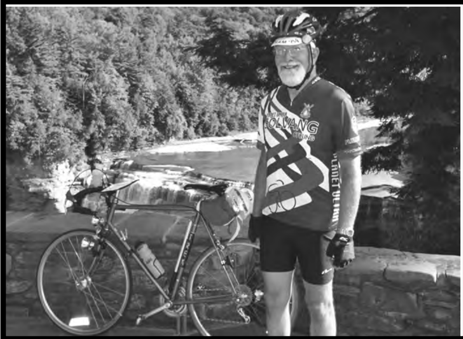
A visiting rider from CA in front of the Grand Canyon of the East at Letchworth State Park at the western end of the Finger Lakes.