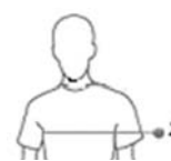
2- Measure the broadest part of your chest.